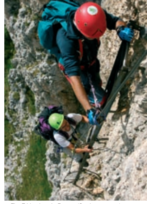
The Tridentina via Ferrata (fixed rope route)

Walk further along path No. 647, (towards the south) which snakes up to the peak