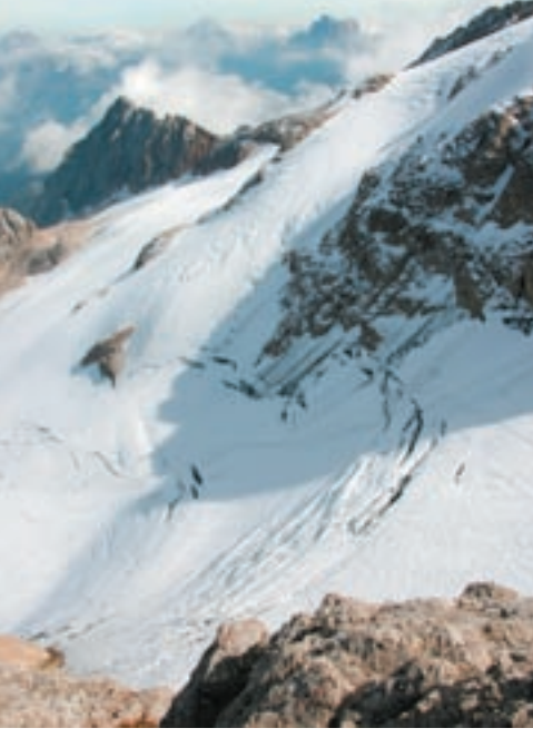
The Marmolada glacier on August 2004

South of the plateau, you reach the Forcella Pradazzo (col at 2,220m).